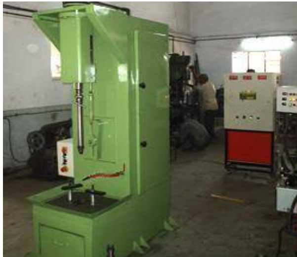
Fig.No.5.2.1 Honing Machine

The Honing process offers advantages of low capital equipment cost, high metal removal rates, and extreme accuracy of 0.001mm (0.00004') in a wide Varsity of materials.