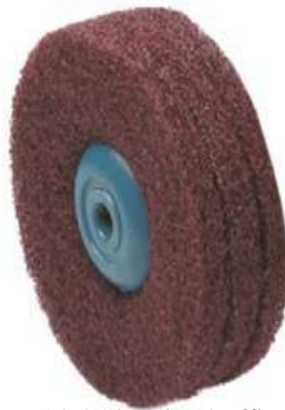
Fig no: 5.2.2 Abrasive buffing wheel

Honing surface have excellent tri biological properties high bearing area ratio, low surface roughness and define cross hatch patten for lubricant retention. Tight bore size and cylindrically control couple with enhanced tri biological characteristics extends the life of bearing.